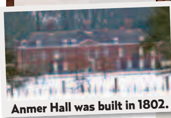
Anmer Hall was built in 1802.

George "has spent a lot of time with the Middletons," says a source.