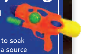
THIS PAGE AND OPPOSITE: FROM LEFT: JASON BULL/CAMERA PRESS; GLENN TERRY/CAMERA PRESS/REDAUX; ALPHAPRESS; SHUTTERSTOCK (8)