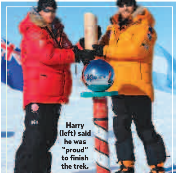
Harry (left) said he was "proud" to finish the trek.

Afternoon After the hunt, William and Kate say their goodbyes, strap George into a car (their newly leased $408,000 Bentley, perhaps?) and head to the Middletons' Bucklebury home.