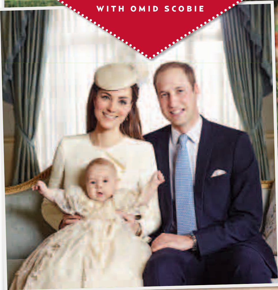
"The focus is on family, church and tradition," a source close to William and Kate says of holidays at Sandringham.