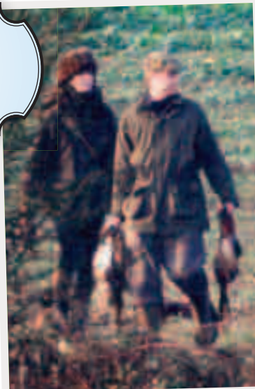
William and Kate bagged some birds at Sandringham in 2008.